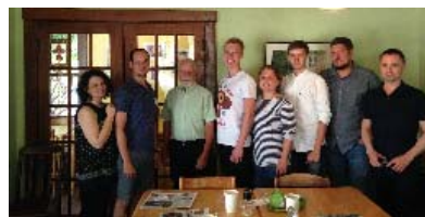
The team met with Rep. Ed Trimmer to discuss alternate energy sources being used in Kansas