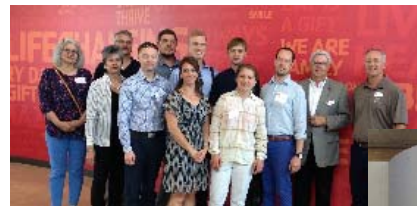
Visiting Wichita YMCA