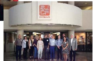
Visiting Architecture Firm